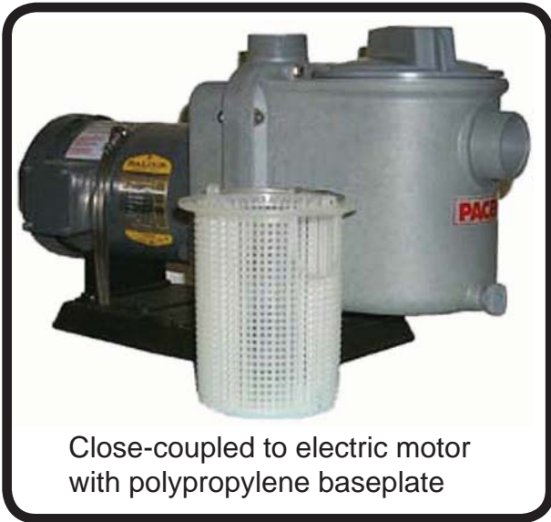
Close-coupled to electric motor with polypropylene baseplate

The self-priming Series 'G' pump is made in either Noryl® or Ryton®, providing a maximum range of chemical resistance. It is available with stainless steel or titanium internal hardware or complete non-metallic solution contact. The pump comes standard with stainless steel external hardware. It is protected with a basket type strainer in either Polypropylene or ECTFE. The large cover makes initial priming and removal of the strainer quick and easy. The cover is the same material as the pump or it can be ordered in clear Lexan®.