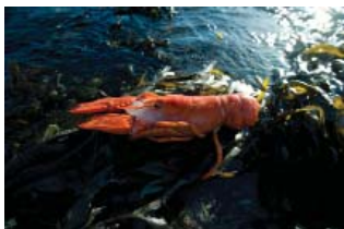
AQUACULTURE LOBSTER FARMING FISH PONDS

After initial prime the Series 'G' pump will lift up to 10 vertical feet (3.1m) and will remain primed even after shutdown. This pump also features an open, non-clogging impeller which is molded in conjunction with the shaft sleeve, thus isolating the shaft from solution contact. The self-priming ability, chemical resistance, light weight and basket strainer make this an ideal chemical transfer, waste treatment, emergency/backup or filter pump.