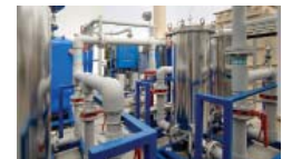
RECIRCULATION, MIXING, FILTRATION, ETC.